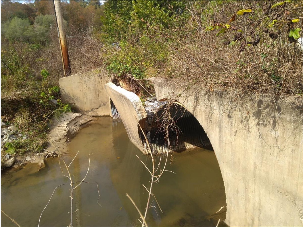
Photo 2 – Culvert wall on the S side of Propst Road that is falling into the stream.